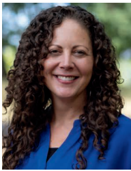
Miranda Boutelle Efficiency Services Group

Sheet metal and high-temperature heat-resistant caulk should be used to seal gaps between framing, chimneys and metal flues.