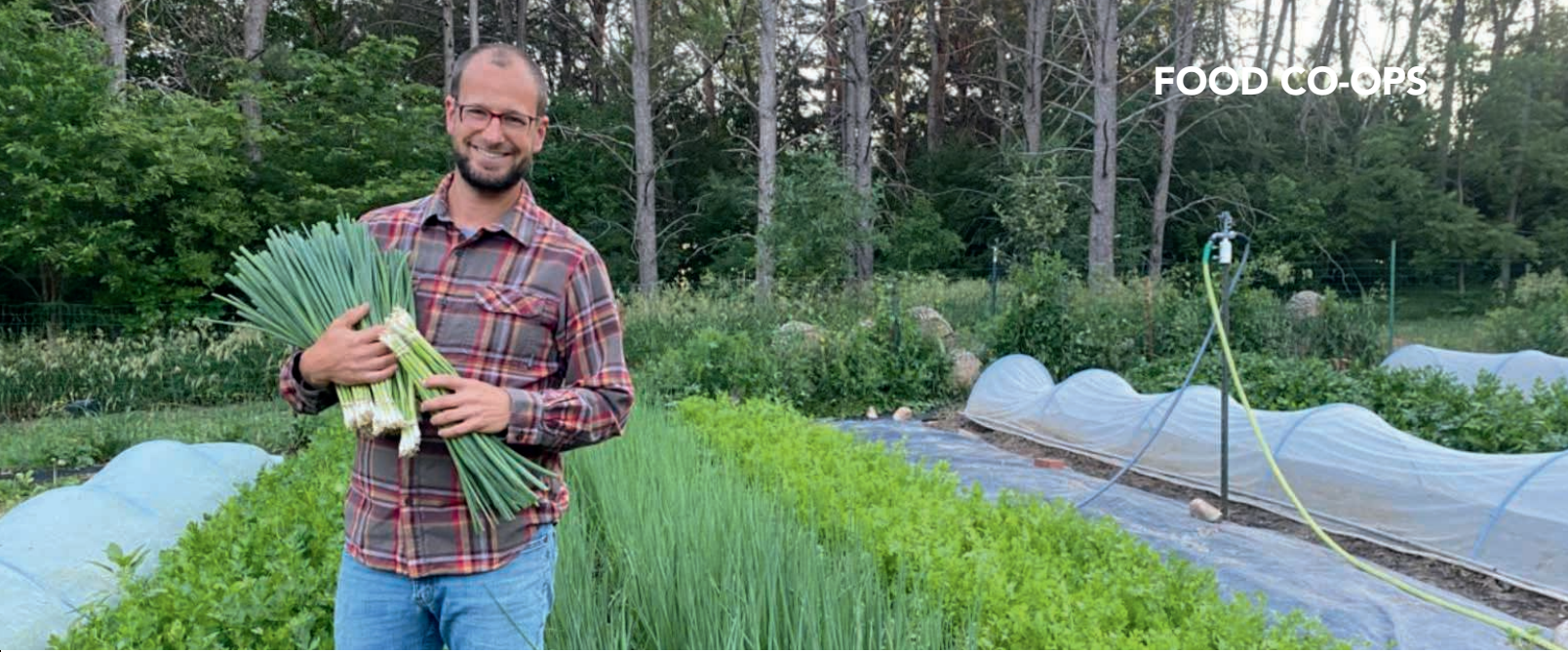
Caselli's Garden is among a growing list of fresh food suppliers for Dakota Community Market.

is designed to provide financing to help build the economic base of rural communities within East River Electric's regional service area. Hundreds of organizations, businesses, medical facilities, housing projects and many more have received financial support through the REED program over the past 20 years.